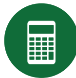
Figure Out What Works for You

Whatever your mortgage needs are, we have convenient ways to help you get started.